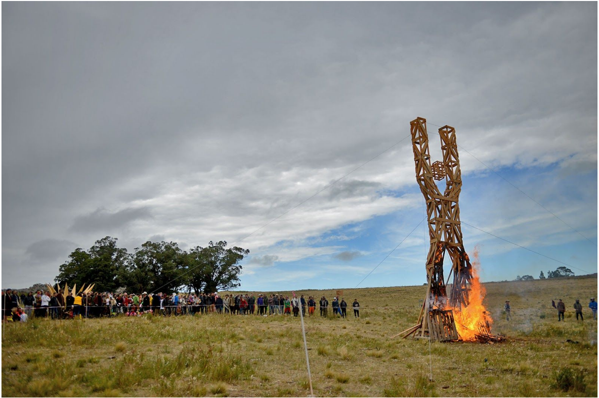
The Man Burning