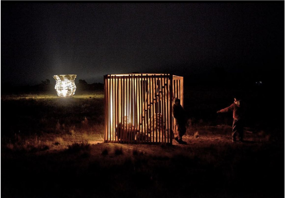
The Mate and the Hiperembole al Cubo at night