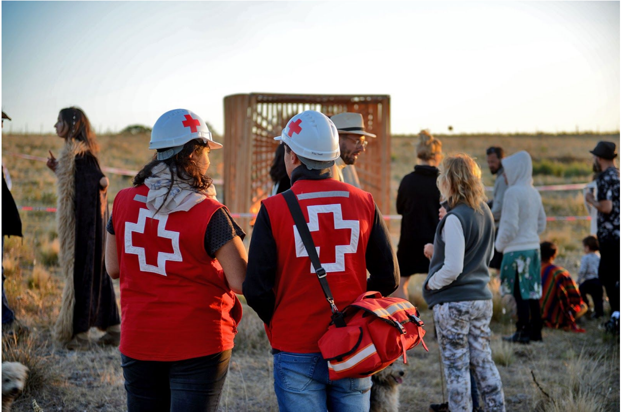
Red Cross was always on site and at every burn