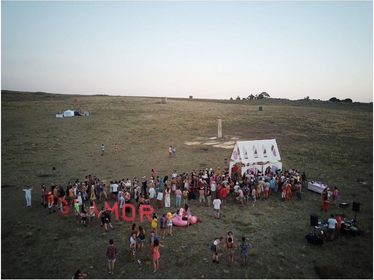
Weddings at Glamor Chappell