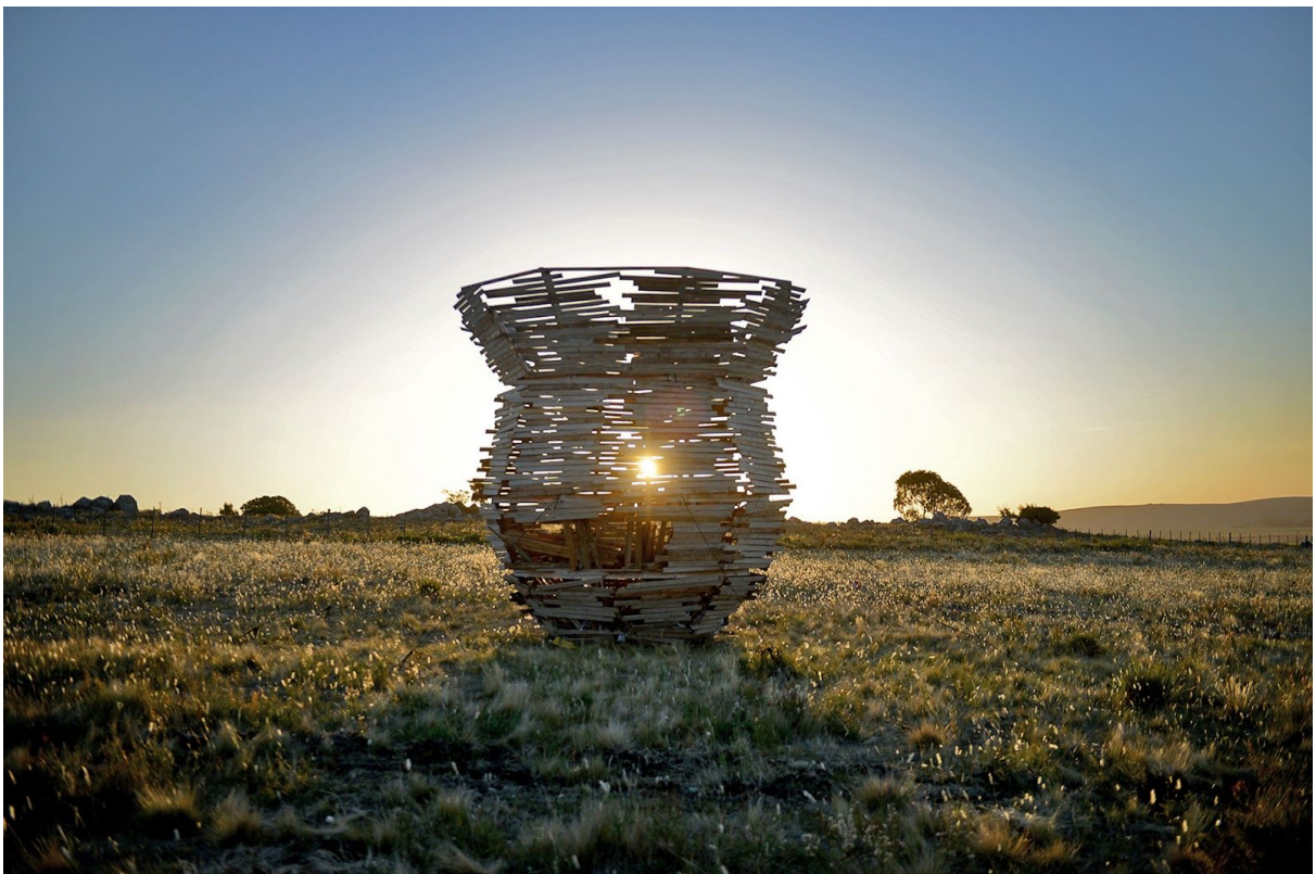
Mate Art Piece