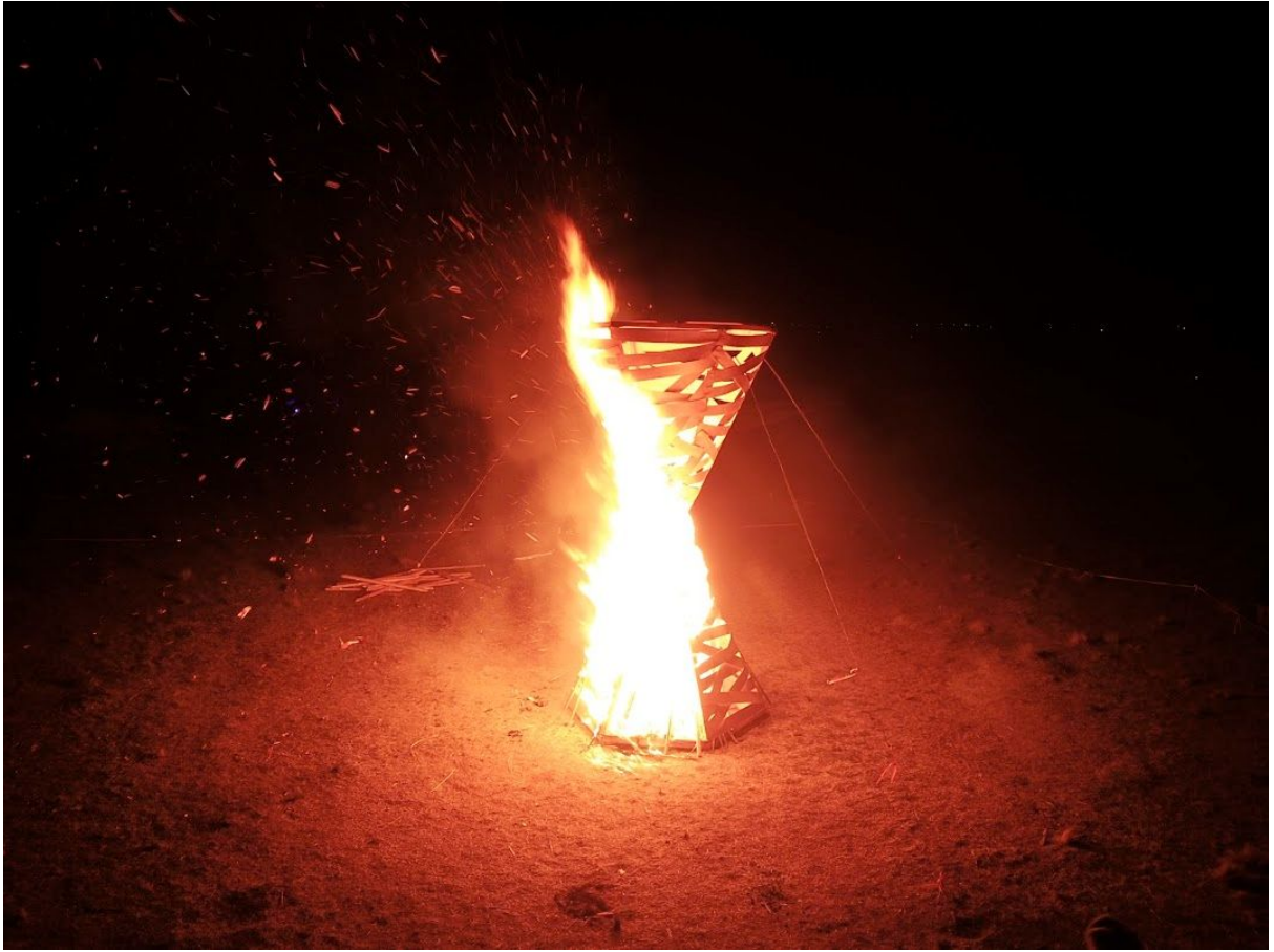
Timeless Clock Burn