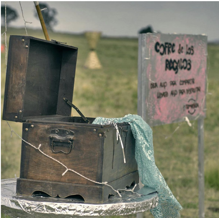
Cofre de los Regalos open filled with gifts.