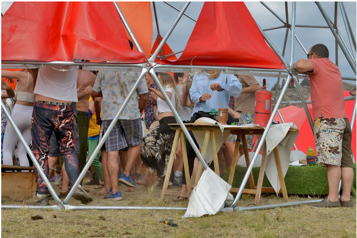
Laughter Meditation at Center Camp