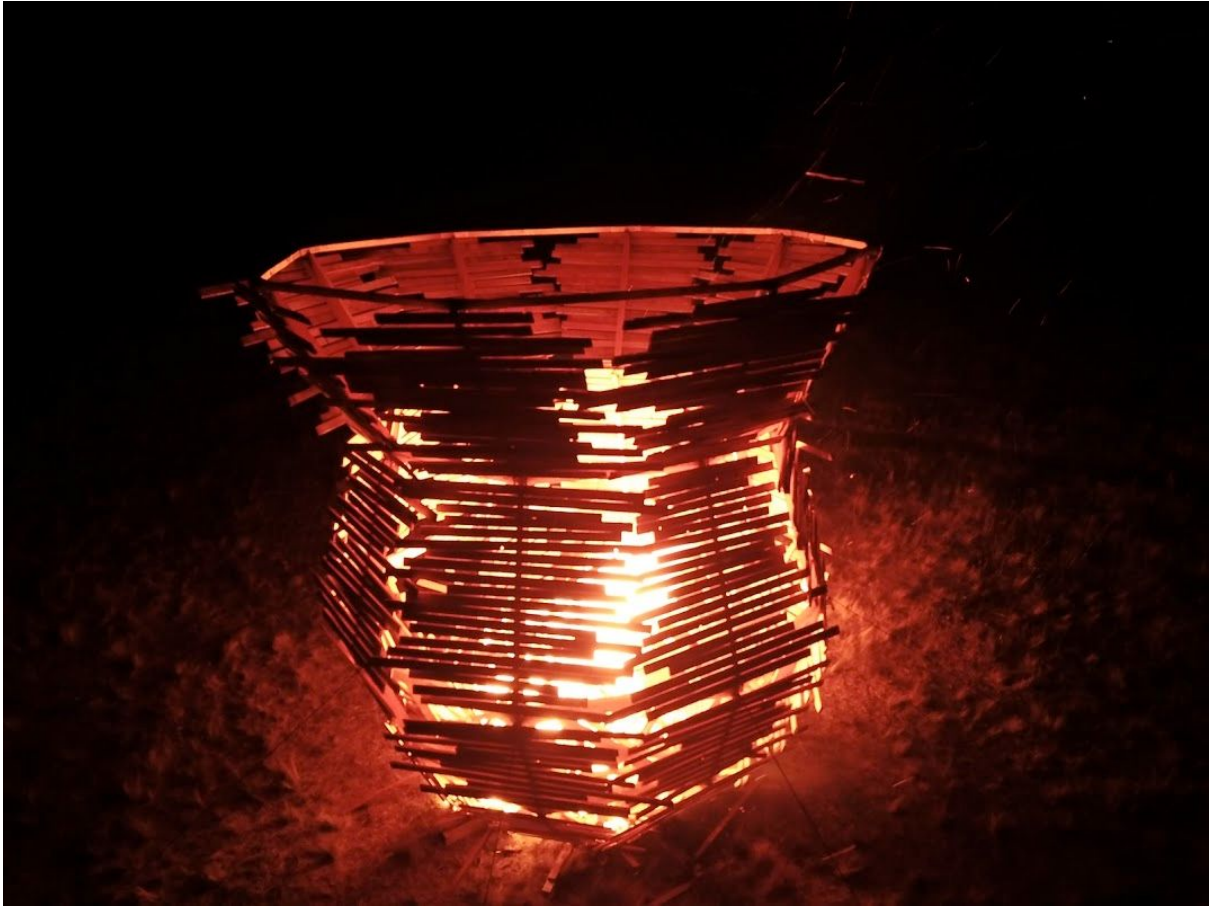
The Mate Burn