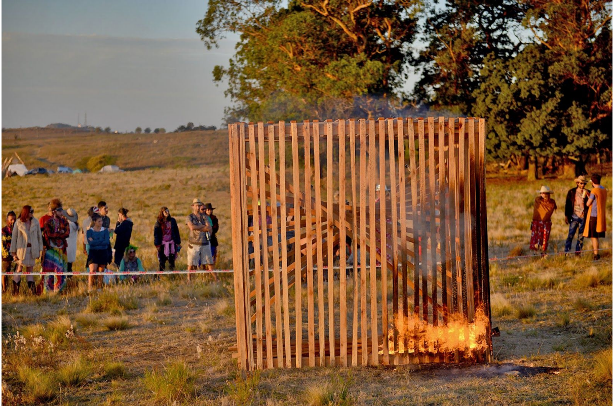
Hiperbole art piece burn