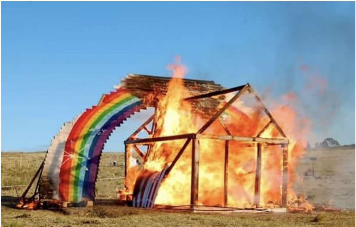
The Rainbow and the Doll House burning.