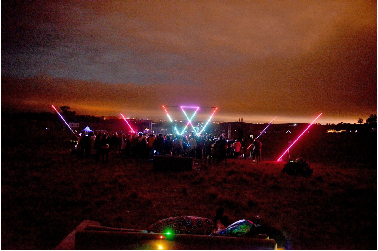
Pampa Warro at night