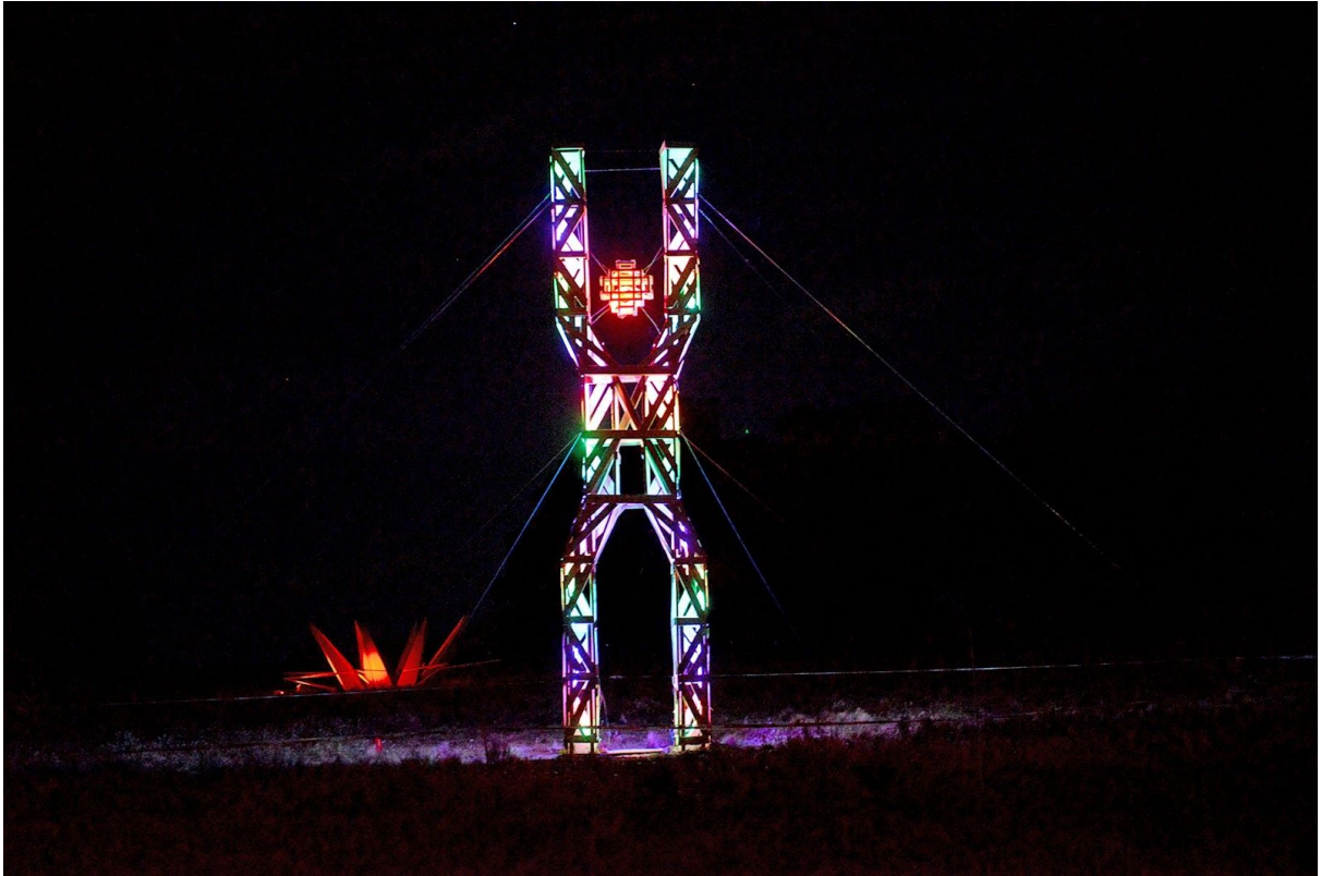
The Man and the Temple at night