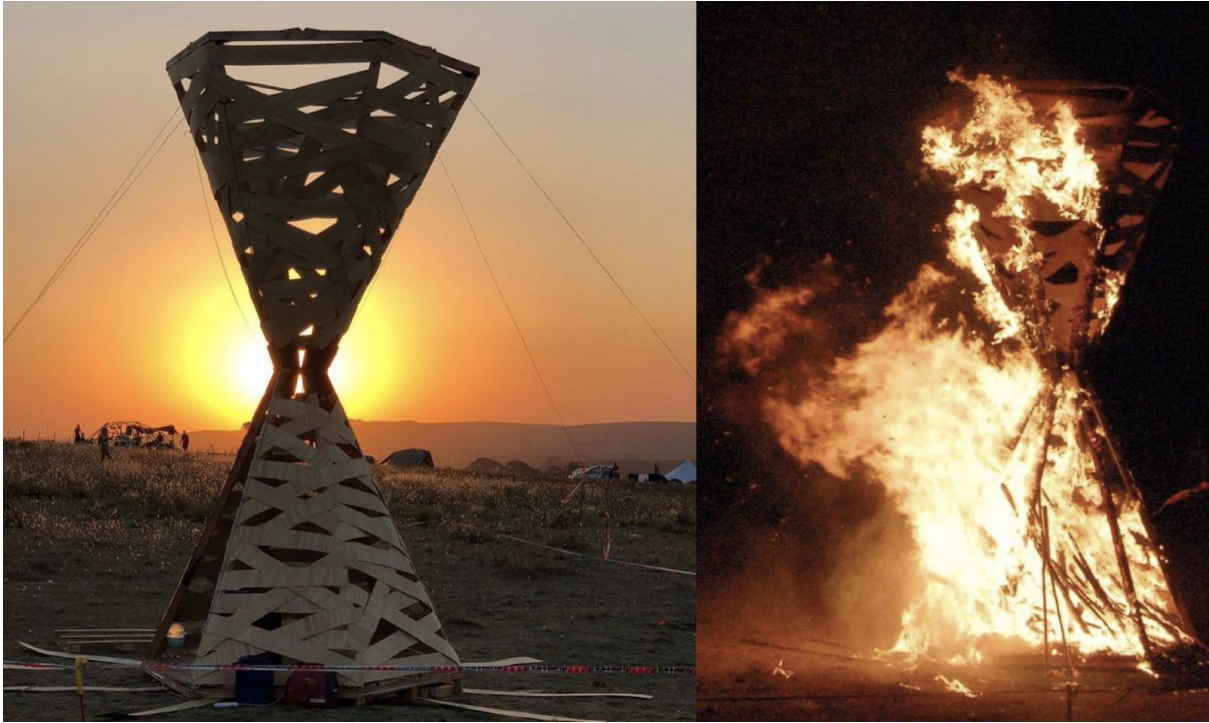
Reloj Sin Tiempo during sunset and burning.